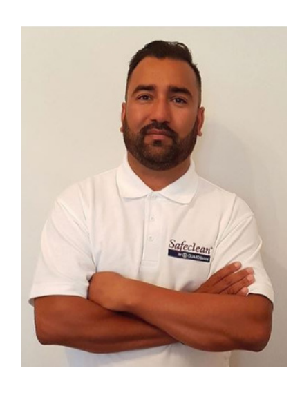
"I love it when my customers are happy with my work and give me 5* feedback"