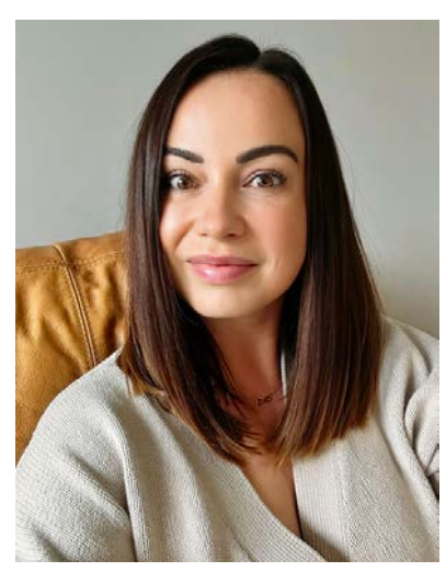
Contact Joanne Reynolds or Jamie Copas

jo.reynolds@safeclean.co.uk Mobile: 07725 241437