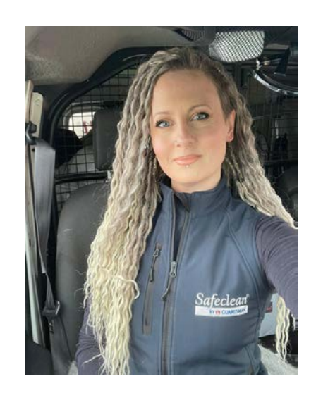
"I'm known as the local specialist, the person to call in a cleaning emergency"

* average sales figures from top 30% of franchisees working as owner/operators & owner/managers in 2024 ** network average for 2023. The amount of guaranteed warranty work and the SLA bonus will vary. *** Work is only guaranteed subject to active contracts, retailer estate, KPIs and SLAs being achieved