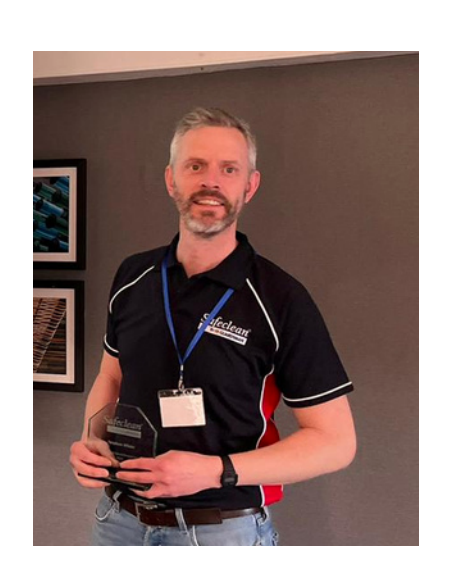
"With multiple techniques and products, I've got so many different ways to earn money"